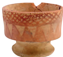
28. Calcite alabaster vessel, Southwestern Arabia, ca. mid-1 st millennium BC, 5.25 cm, diameter of base 7.1 cm.