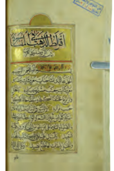
5. Illuminated Arabic manuscript, Yemen, 27 x 16 cm.