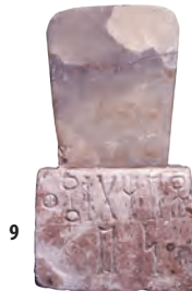
9. Calcite-alabaster stela, Yemen, 3 rd c. BC-3 rd c. AD, 19 x 10.6 x 5.5 cm.