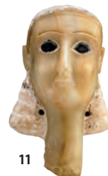
11. Alabaster, stucco and bitumen head, Yemen (Wadi Bayhan), 1 st c. BC-mid-1 st c. AD, 30.2 x 18.2 x 17.3 cm.