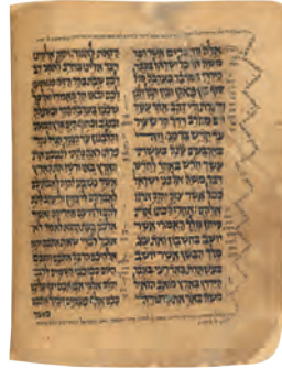
4. Hebrew manuscript, Yemen (Sanaa), 14 th -15 th c., 27.5 x 20.9 cm.