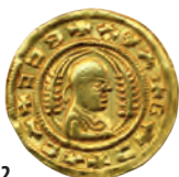
32. Gold coin, Yemen (North of Aden), ca. AD 450-500, Ø 0.17 cm.