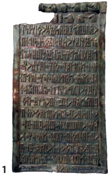
1. Copper alloy plaque, Yemen (Amran), 1 st c. BC-2 nd c. AD (probably), 31.8 x 17.8 x 2 cm.

Ancient alphabet, Arabic or Hebrew writings on stone or metal plates; on wooden sticks; on paper or parchment, with calligraphy or illuminations.