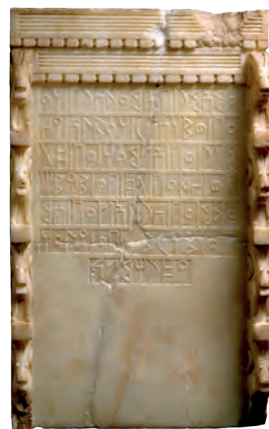
26. Limestone libation table, Yemen (Marib), 10 x 123.5 x 69 cm.