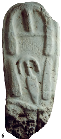
6. Limestone stele, Yemen (Hadramaut), late 3 rd /early 2 nd millennium BC, 80 x 34 x 13 cm.

Stelae: Funerary stelae carved in stone.