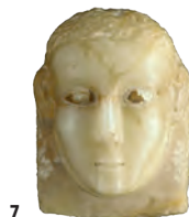
7. Calcite travertine bust, Yemen, 3 rd c. BC-1 st c. AD, 21.4 x 16.2 x 12.4 cm.