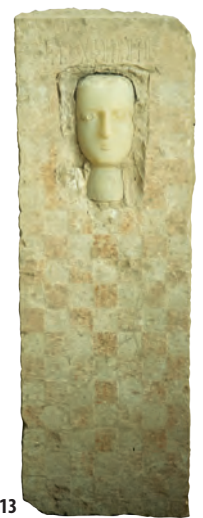
13. Limestone, calcite-alabaster and gypsum stela, Yemen (Marib), 3 rd -1 st c. BC, 102 x 24 x 18 cm.