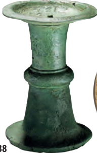
38. Copper alloy incense burner or lamp, Yemen, 1 st -2 nd c. AD.