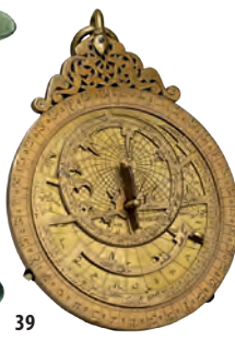
39. Brass astrolabe, Yemen, AD 1291, 19.4 x Ø 15.6 cm.