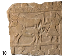
10. Limestone funerary stela fragment, South Arabia, 1 st -3 rd c. AD, 31.5 x 33.5 x 8 cm.