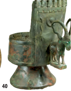
40. Bronze incense burner, Southwestern Arabia, ca. mid-1 st millennium BC, 27.7 x 23.7 x 23.2 cm.