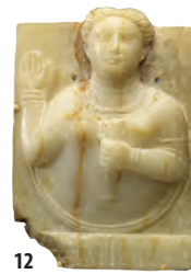
12. Calcite-alabaster stela, Arabian Peninsula, 1 st c. BC-1 st c. AD, 32.1 x 23.3 x 3.5 cm.