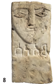
8. Calcite-alabaster miniature stela, Yemen, 13.7 x 6.6 x 2.8 cm.