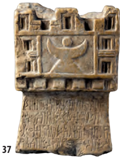
37. Limestone incense burner, South Arabia, late 3 rd c. AD, 25.5 x 18 x 16 cm.

Incense burners, astrolabes and lamps: Made of metal, stone or clay, of various shapes and forms.