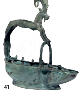
41. Copper alloy lamp, Yemen (Hadramawt), 2 nd -3 rd c. AD, 20 x 18.7 x 8.7 cm.

Ornaments: Metal hands, Torah sticks (finials) in different shapes and materials.