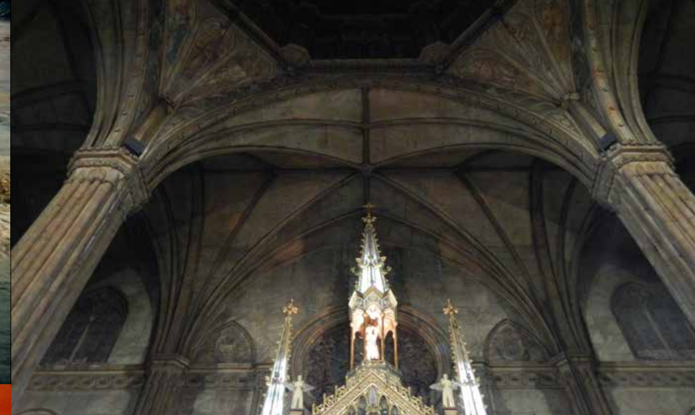
PHILIPPINES Conservation of the 19th-century San Sebastián basilica in Manila