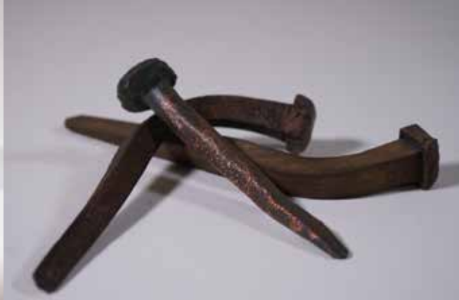
SOUTH AFRICA Conservation of objects from the 18th-century São José shipwreck in Cape Town