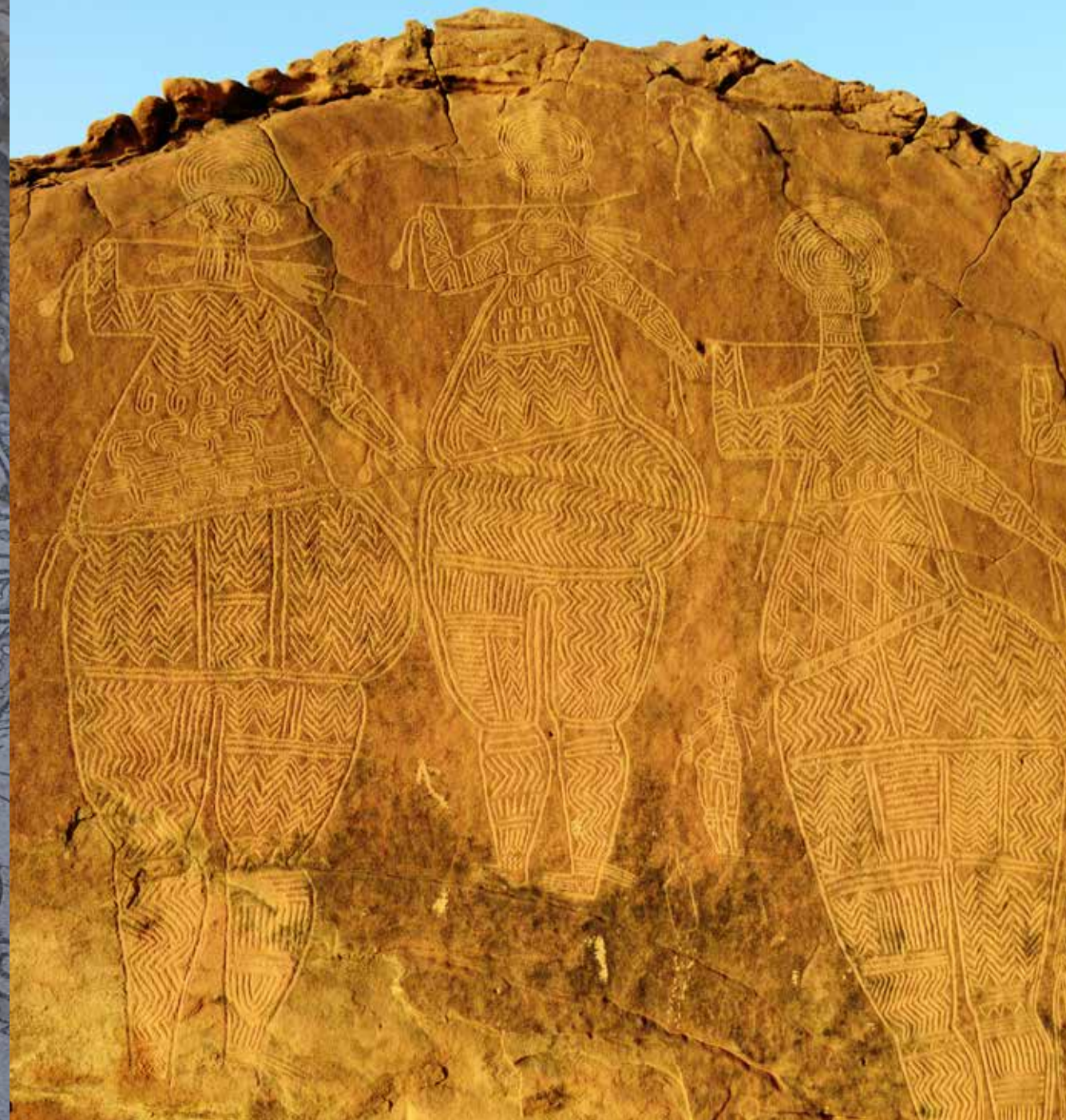
CHAD Conservation of endangered prehistoric and historic rock art in the Central Sahara ARMENIA Conservation of the late 17th-century church of Saint Sargis in Meghri (front cover)