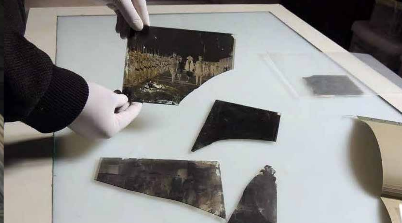
LIBYA Documentation and safeguarding of photographic collections at the Red Castle in Tripoli