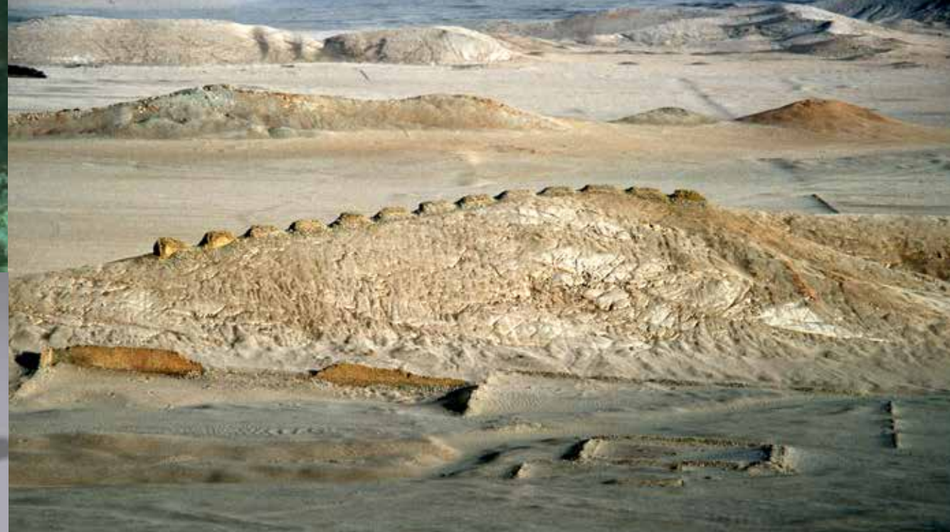
PERU Conservation of 4th-century BC astronomical horizon markers at Chankillo archaeological site