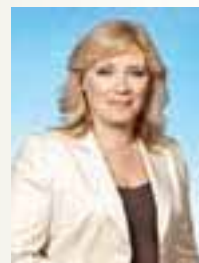
Prime Minister of Slovak Republic Iveta Radičová

Fulbright Scholar alumna Iveta Radičová was appointed Prime Minister of the Slovak Republic on July 8, 2010. Ms. Radičová is a sociologist and former Minister of Labor and Social Affairs. She was a 1998-1999 Fulbright Scholar at The New School in New York. A second Fulbright alumnus, Daniel Lipšic, serves as interior minister in the new government. He studied at Harvard University, receiving a Master of Laws degree there in 2000.