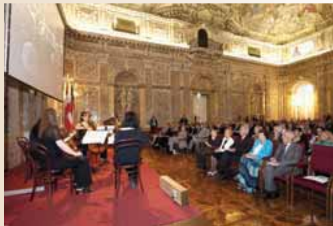
U.S.-Austria Fulbright 60th anniversary celebration at the Academy of Sciences in Vienna, Austria.

2010," featuring interviews with generations of Austrian Fulbright grantees, starting with the inaugural class of 1951-1952, discussions with current U.S. Fulbrighters, and archival footage and photo material. Additional screenings were shown October 2010 at the German Studies Association Annual Meeting in Oakland, California, the Austrian Embassy in Washington, DC, and the Institute of International Education in New York.