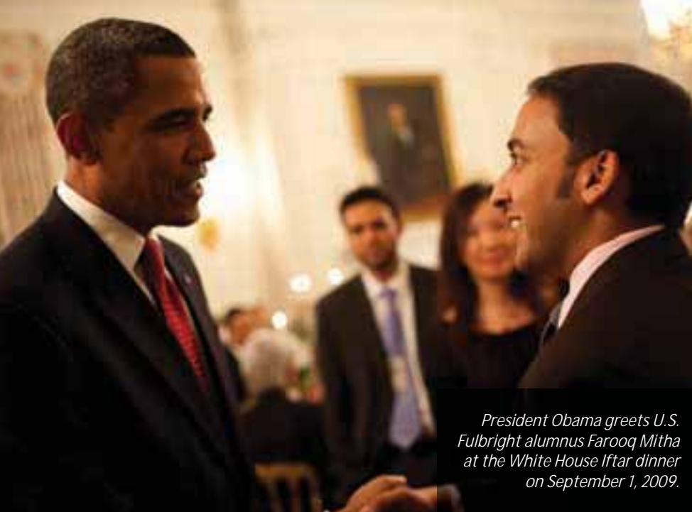
President Obama greets U.S. Fulbright alumnus Farooq Mitha at the White House Iftar dinner on September 1, 2009.