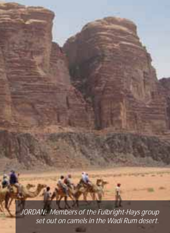
JORDAN: Members of the Fulbright-Hays group set out on camels in the Wadi Rum desert.