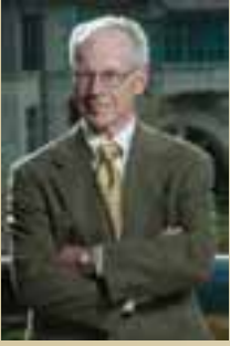
Fulbright alumnus and Nobel Prize winner Oliver E. Williamson