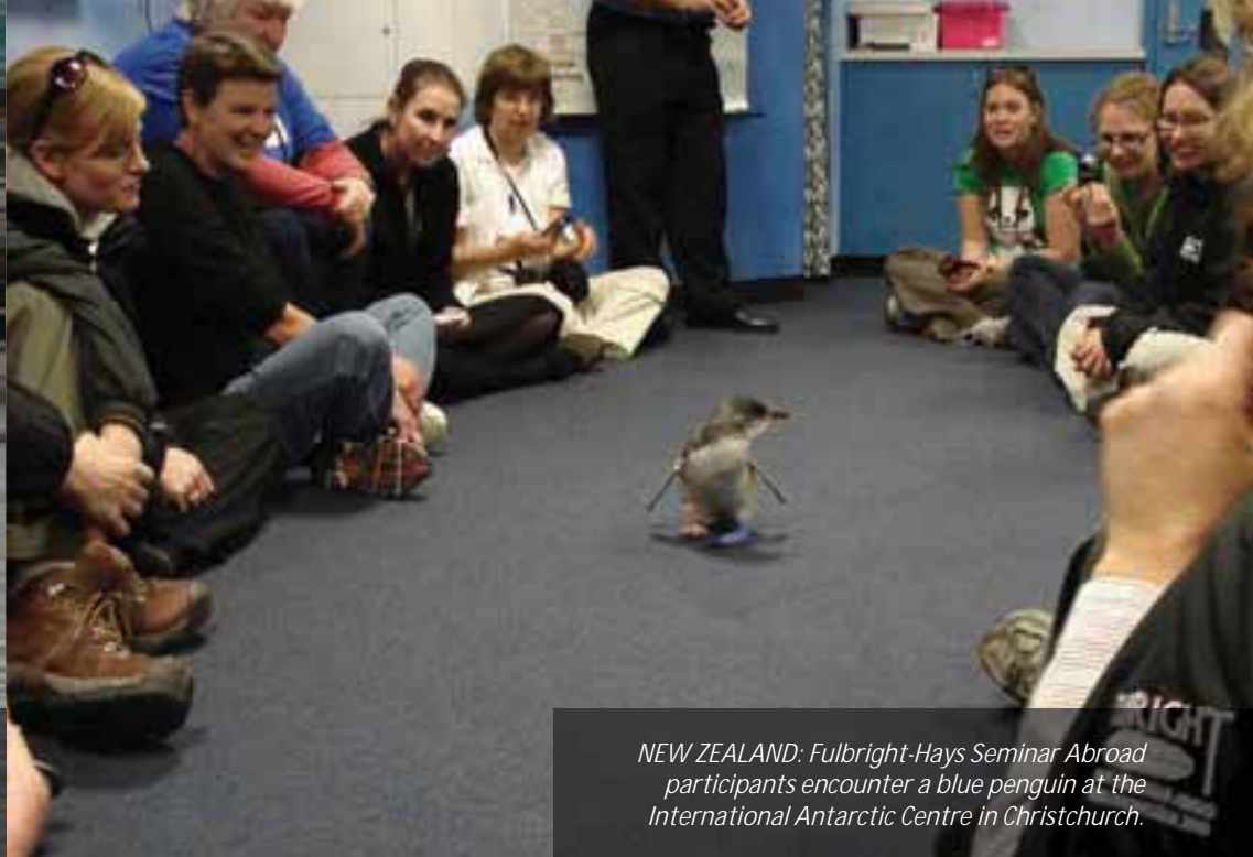
NEW ZEALAND: Fulbright-Hays Seminar Abroad participants encounter a blue penguin at the International Antarctic Centre in Christchurch.