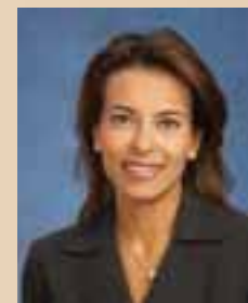
Ms. Dina Habib Powell Managing Director and Global Head Office of Corporate Engagement Goldman, Sachs & Co. New York, New York