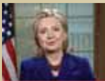
Secretary of State Hillary Rodham Clinton