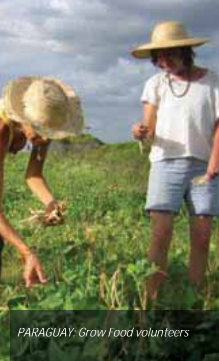
PARAGUAY: Grow Food volunteers