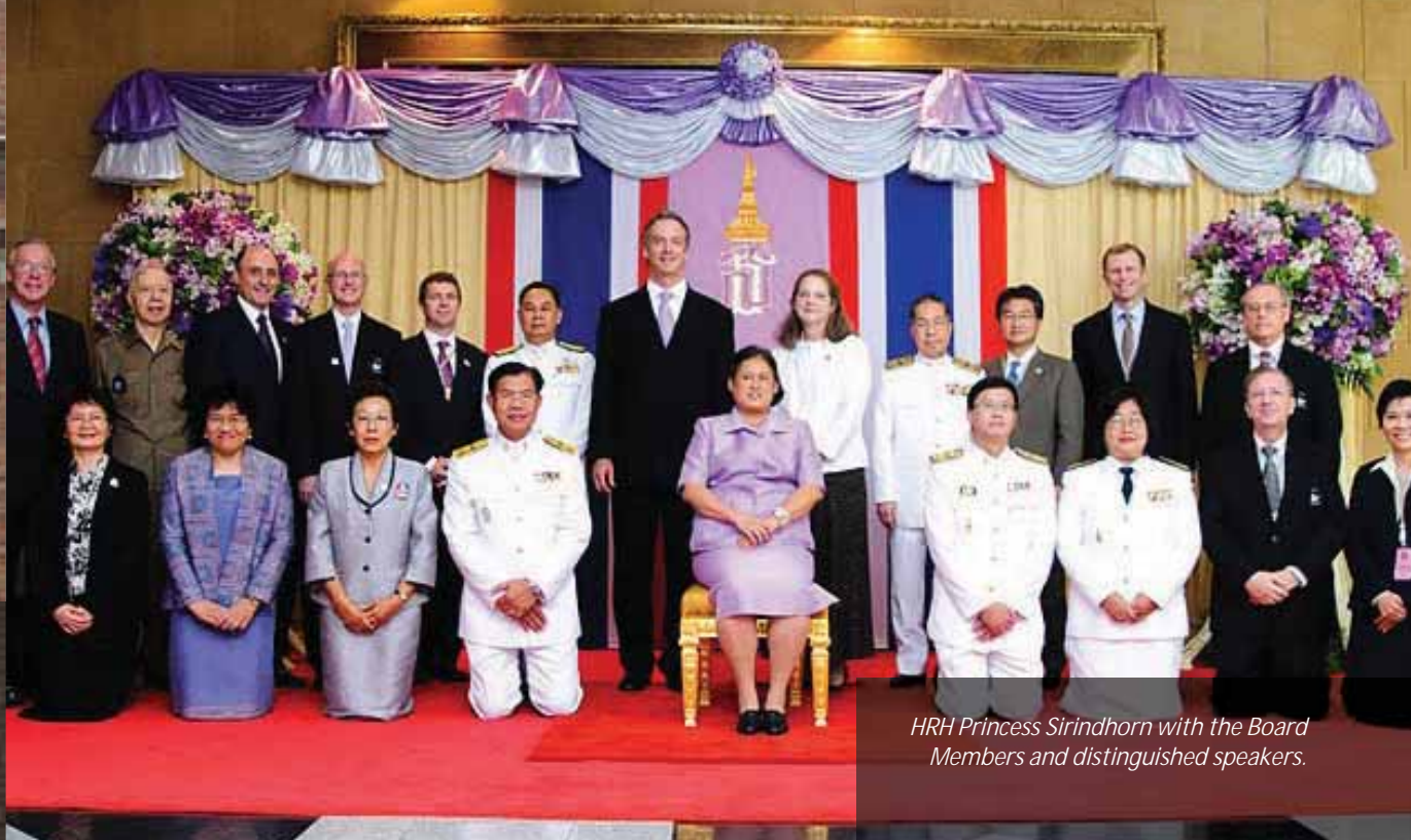
HRH Princess Sirindhorn with the Board Members and distinguished speakers.