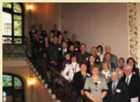
Participants of the Russian Fulbright Alumni Conference, "Higher Education for Tomorrow's Professionals."