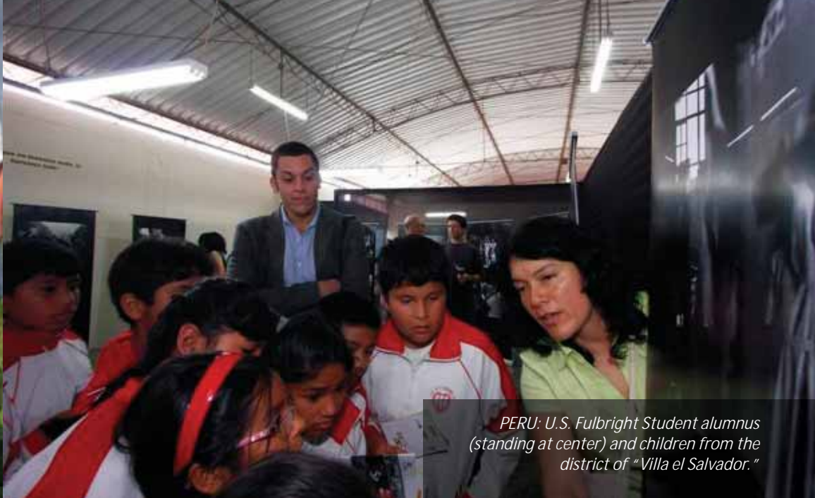
PERU: U.S. Fulbright Student alumnus (standing at center) and children from the district of "Villa el Salvador."