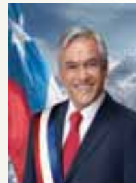
President of Chile Sebastián Piñera