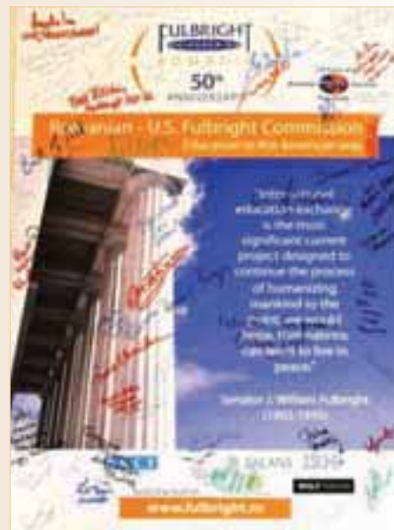
Poster of the 50th Anniversary of the Fulbright Program in Romania.