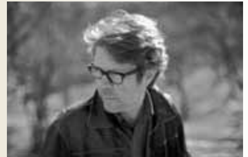
Fulbright alumnus and novelist Jonathan Franzen

Fulbright alumnus and American novelist Jonathan Franzen appeared on the August 23, 2010 cover of Time magazine. The issue features an interview with Mr. Franzen to mark the publication of his fourth novel Freedom . Mr. Franzen's last novel, The Corrections , won a National Book Award in 2001. Mr. Franzen is the first living American novelist to appear on a Time magazine cover for a decade. Fulbright alumnus the late John Updike appeared on the cover in 1968. A 1981 graduate of Swarthmore College in Pennsylvania, Mr. Franzen was a 1981-1982 Fulbright Student studying German literature at Freie Universität in Berlin. Mr. Franzen said of the experience, "A Fulbright year in Berlin was the most valuable pure gift that anyone has ever given me." In the history of Time , only 12 American novelists have been featured on its cover.