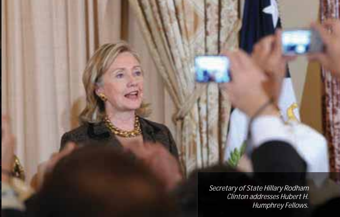
Secretary of State Hillary Rodham Clinton addresses Hubert H. Humphrey Fellows.